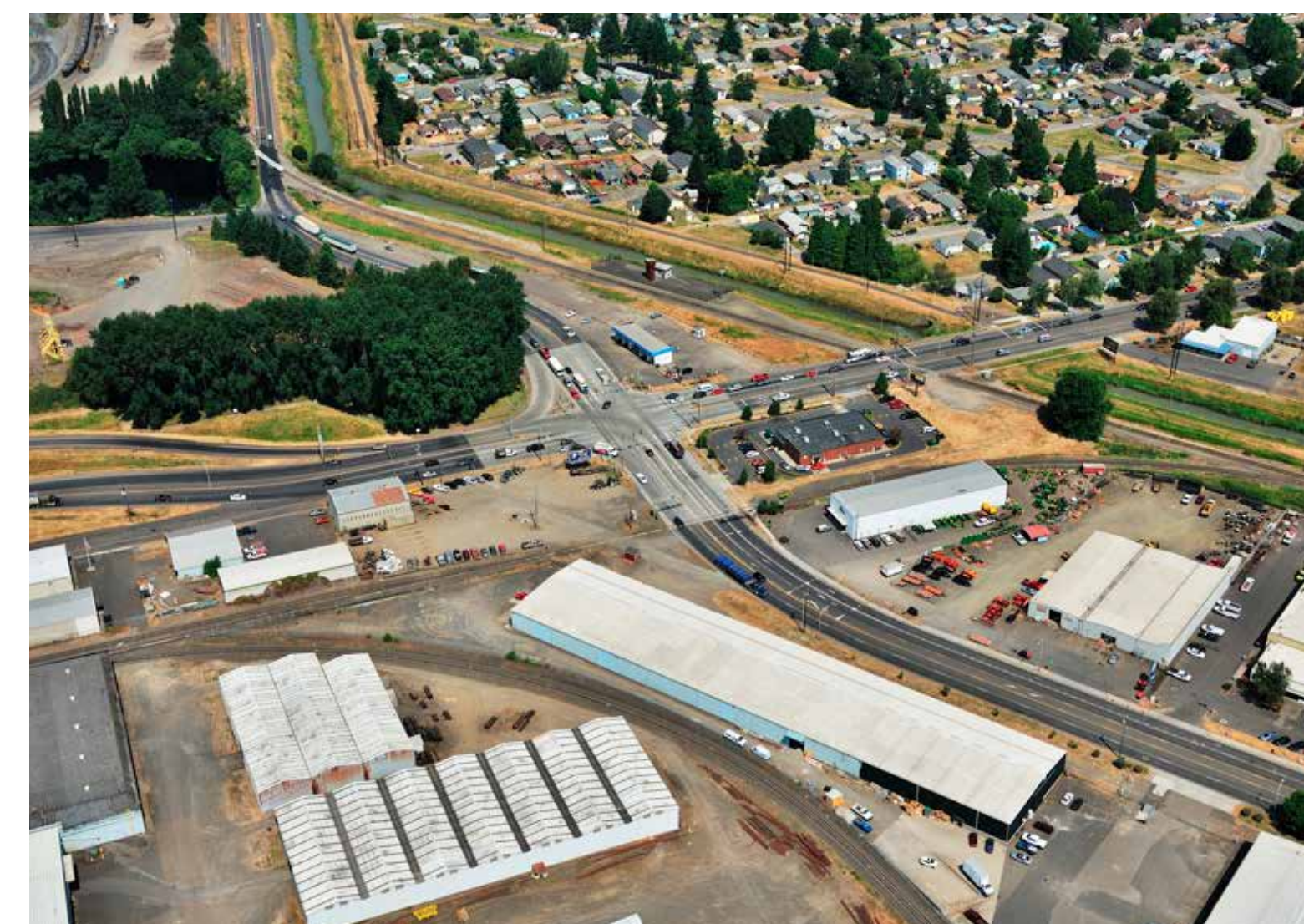
AIR QUALITY, ENERGY & GREENHOUSE GASES