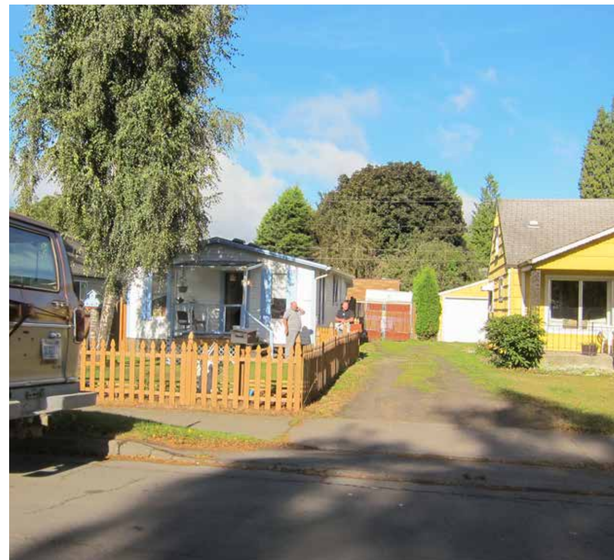
RESIDENTS AND BUSINESSES